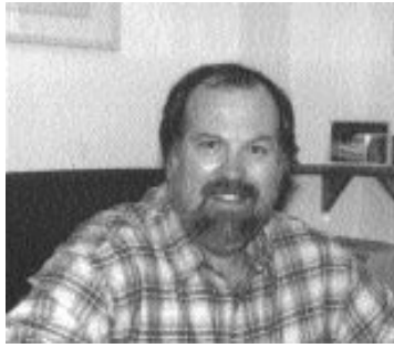
By Doug Spray

The time of year is approaching when some of you will begin sweeping away the snow and chipping ice off the batting cages. Springtime brings renewed interest in baseball and the official start of the batting cage season. With the availability of practice fields diminishing, the obvious target groups for promotions will be the Little League and softball teams in your area. While these are the people that will use your facility due to its nature, promotions and discounts will give them the incentive that increases frequency and volume when they are there.